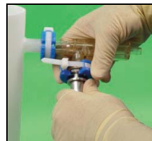
Insert cable tie end and slide clamp closed