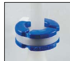
SaniSure clamp installed

As the industry's attention focuses on reducing cleaning validation costs and improving tear down/installation times, the SaniSure CLAMP answers each of these challenges, improving overall production efficiency.